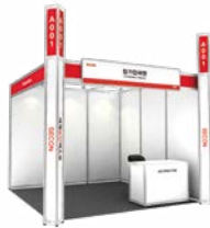
Shell Scheme Booth